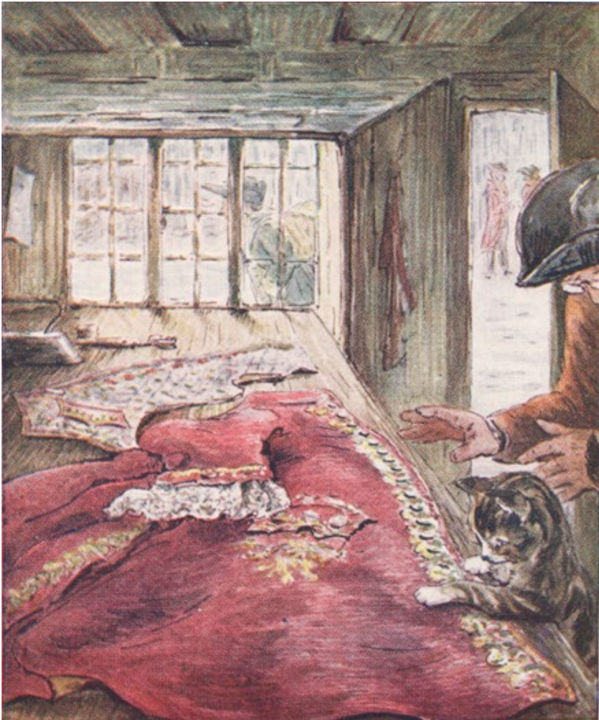
The Tailor of Gloucester (1903), page 77. The Morgan Library & Museum; PML 87739.