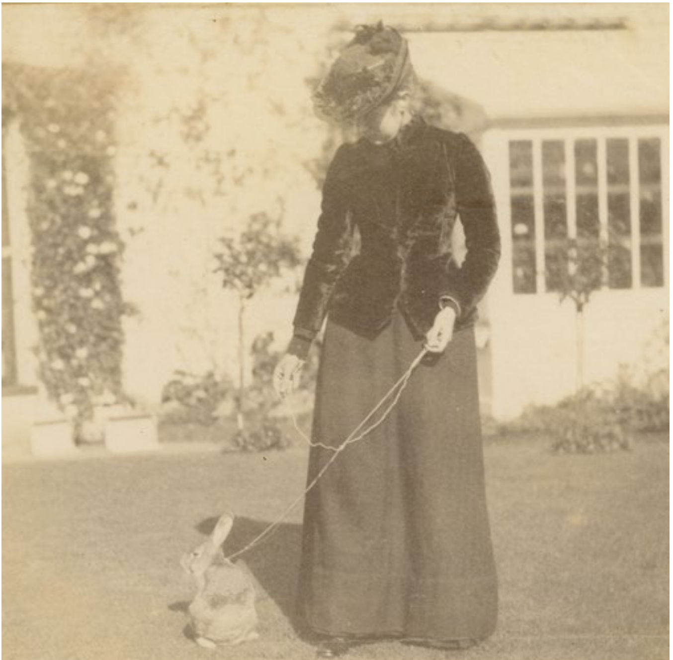
Beatrix with her pet rabbit Benjamin Bouncer at Bedwell Lodge, Hertfordshire, September 1891.