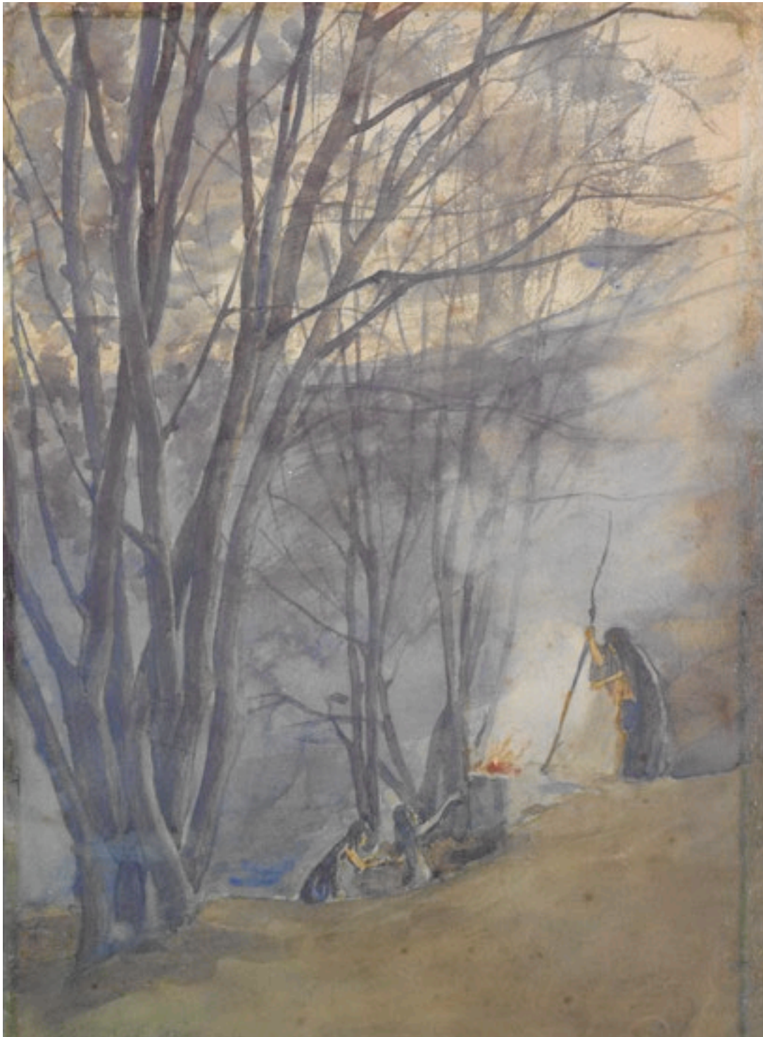
Beatrix Potter (1866–1943), The Three Witches of Birnam Wood , 1878. Watercolor over graphite. Cotsen's Children's Library, Special Collections, Princeton University Library, 33207.