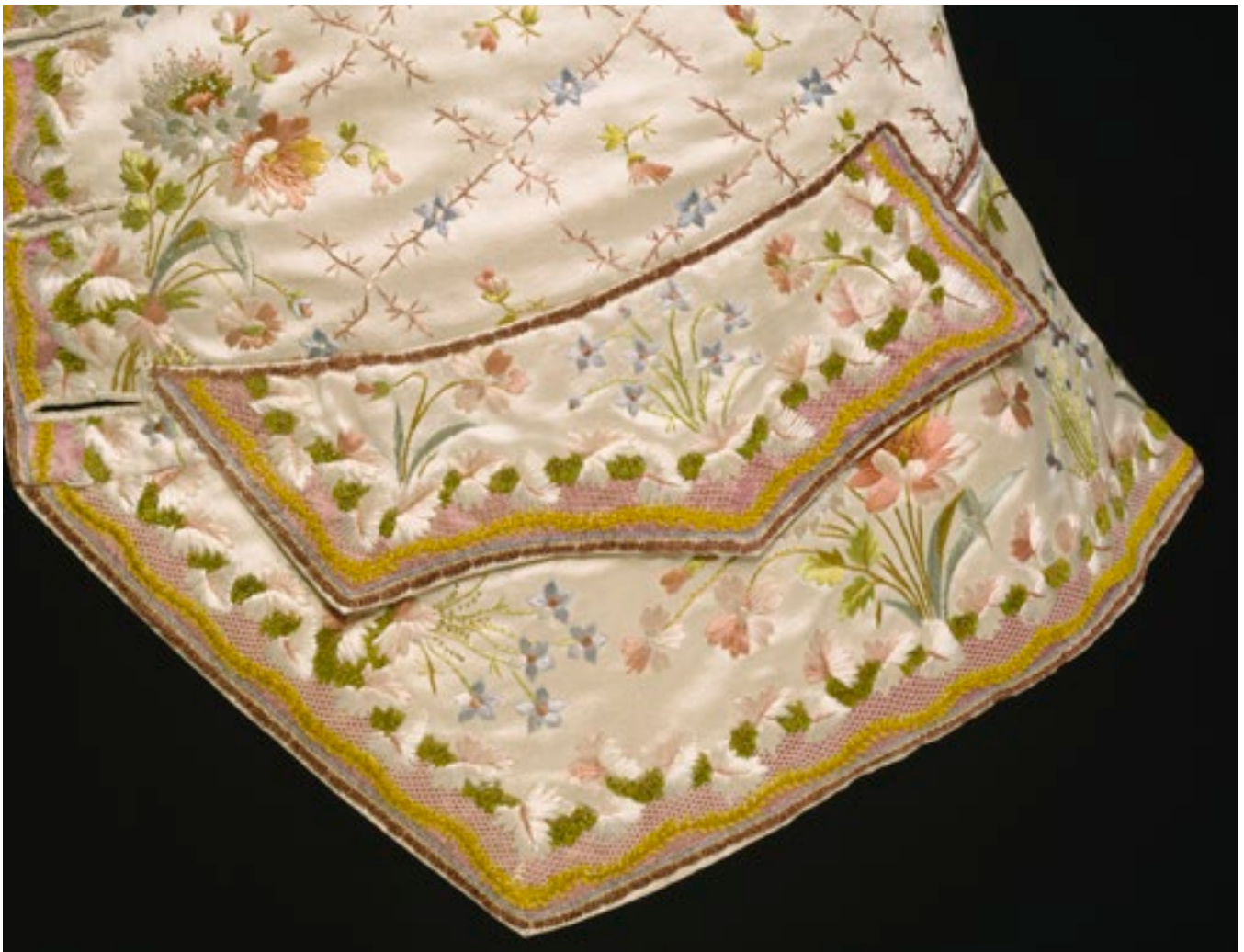
Detail from a court waistcoat, 1780–89. V&A: 652A-1898.