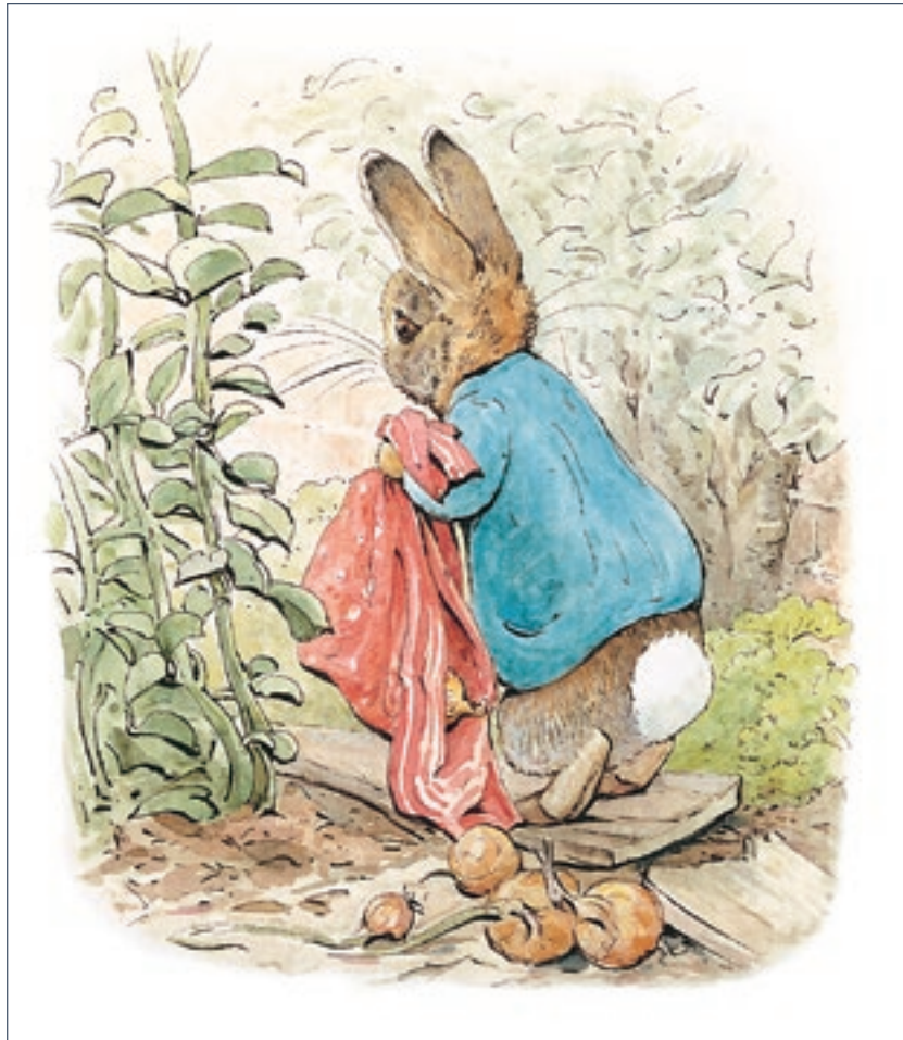
The Tale of Benjamin Bunny (1904), page 35. The Morgan Library & Museum; PML 87742. © Frederick Warne & Co. Ltd., 1904, 2002.