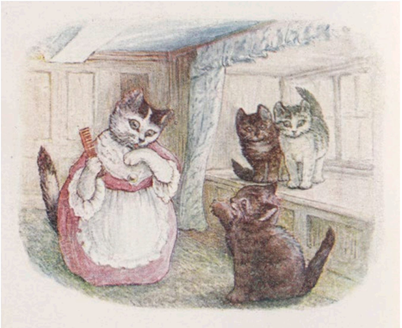
The Tale of Tom Kitten (1907), page 20. The Morgan Library & Museum; PML 87744. Photo: Carmen González Fraile. © Frederick Warne & Co.