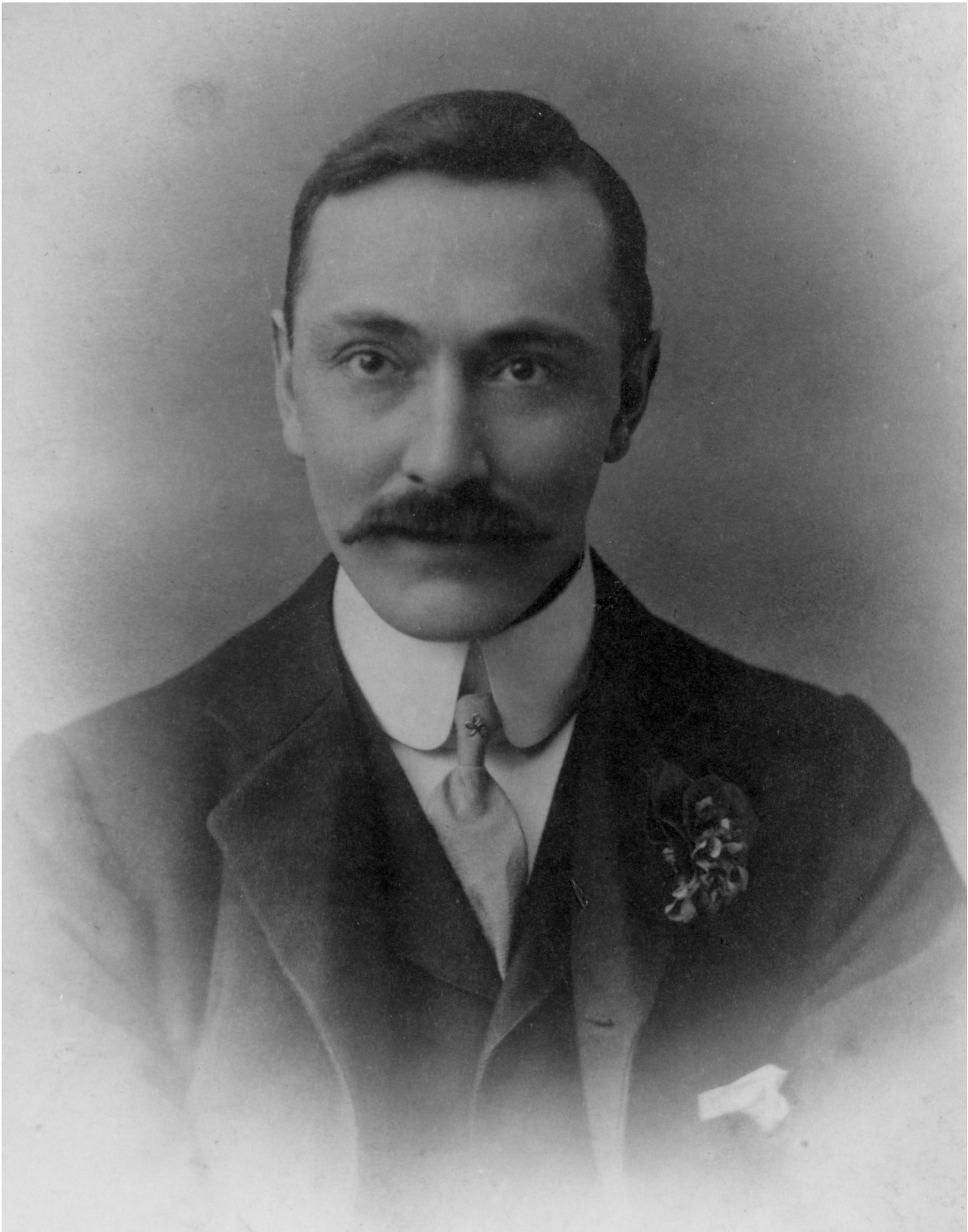
Norman Warne, ca. 1890–1905.